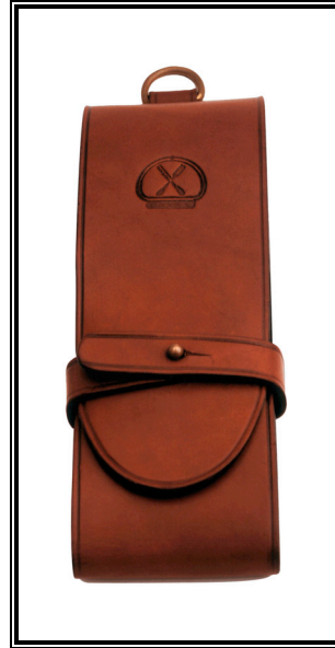
La Cornue Chef Knife, Carving Fork and Case, and Sharpening Stone

A coticule stone is indispensable for knife sharpening. The La Cornue Sharpening Stone is carved on site at the source of the stone in Belgium. The 100% cowhide saddle-leather case is designed to withstand the most extreme conditions. For small knives, the stone is left in the case. For large knives, the stone is removed from the case and the knife is positioned at a 60° angle from the work surface. The La Cornue Sharpening Stone retails for approximately $450.