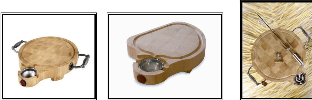
From left: La Cornue Table Carving Board, Cutlet Carving Board and Poultry Carving Board

Stress and mess-free carving begins with the right chef’s knife, sharpening stone and serving fork. An attractive carving board takes center stage on the table. La Cornue offers specialty carving boards designed specifically for poultry, roasts, cutlets and ham. And just in case, why not wear a bona fide leather butchers’ apron.