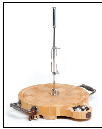
La Cornue Poultry Carving Board