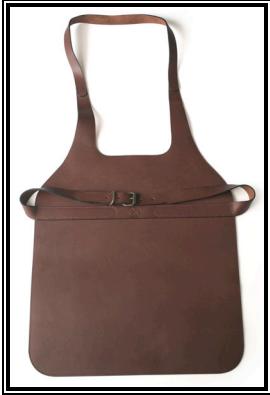
La Cornue Leather Butchers' Apron

And for a presentation worthy of any Top Chef, why not don a La Cornue leather butcher's apron in either saddle leather or black leather, which retails for about $425.